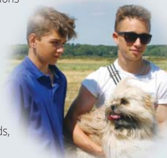
The boys, summer 2015